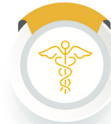
Healthcare Industrial UV