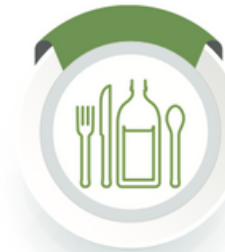
Food & Beverage Industrial UV