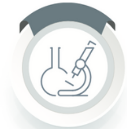
Pharmaceuticals Industrial UV